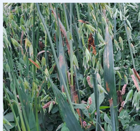
Oat leaf spot symptoms