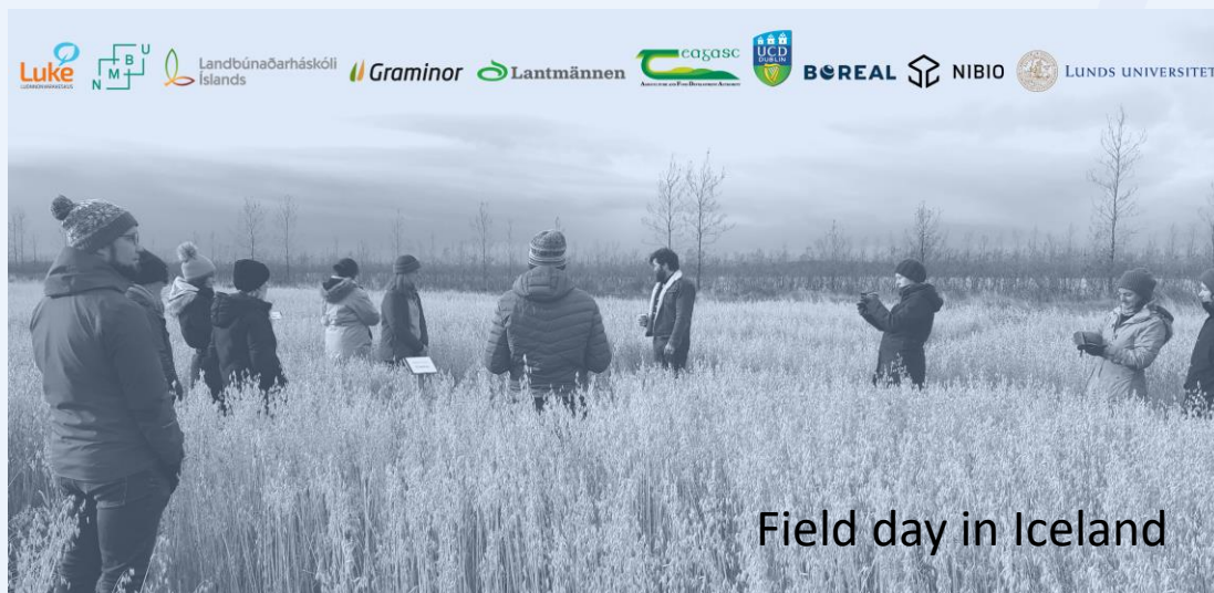
Field day in Iceland