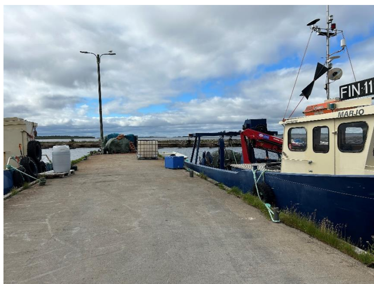
Kiviniemi port in Finland.

Our project is in full swing, and this newsletter contains plenty of interesting results for you to browse. The main topic in this newsletter is the report on end-of-life fishing gear collection in the NPA area. After the publication of the last newsletter, we've also released our proper website. The website will contain all our publications and news items, so make sure to bookmark it.