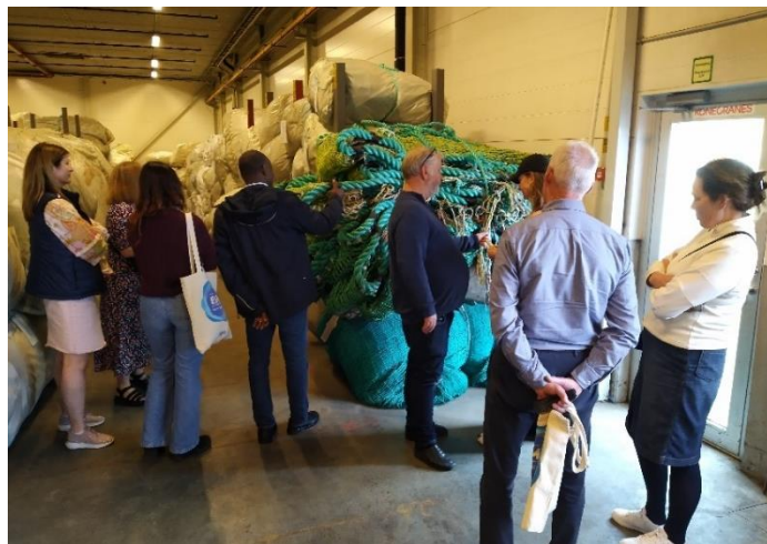
Our team inspecting ropes that are used in fishing nets during our visit to Mørenot.