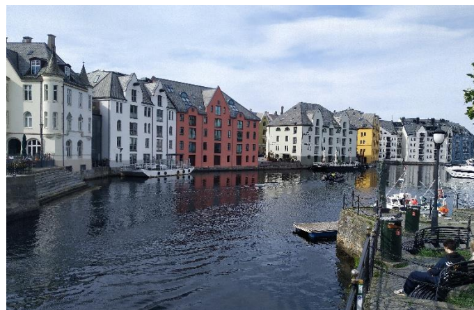
Surrounded by water from many directions – you are never far away from the sea in Ålesund!