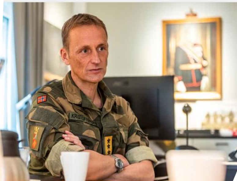
LEVERER PLAN: Mandag sender forsvarssjef Eirik Kristoffersen den fagmilitære planen for felles nordisk forsvar, til politisk ledelse i Forsvarsdepartementet.